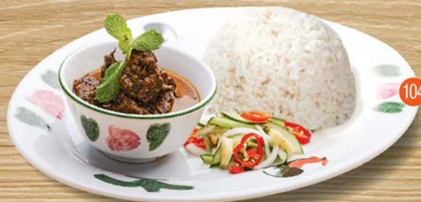
Beef Rendang Platter 104 咖喱牛肉饭

*Prices are subject to 6% Service Charge & 6% Service Tax. *Pictures shown are for illustration purpose only. Actual presentation may vary.