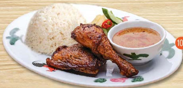
Sedap Chicken Platter 102 食得口乐炸鸡饭 RM17.90