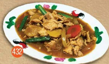
432 Oriental Ginger Chicken 中式姜葱鸡肉 RM18.90