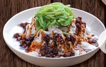
972 Cendol RM 7.50