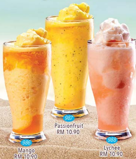
986 Mango RM 10.90