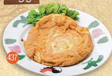
437 Telur Dadar 芙蓉蛋 RM9.50