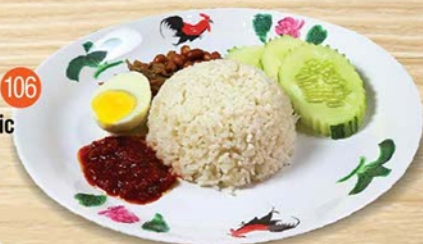
106 Nasi Lemak Classic 椰浆饭 RM8.50