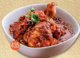
435 Ayam Merah Tomato 香辣红番茄鸡 RM9.50(per pc)