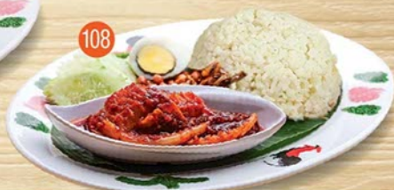
Nasi Lemak with Sambal Sotong 食得口乐苏东椰浆饭 RM18.50