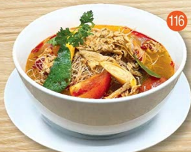
116 Chicken Tom Yum Meehoon 鸡肉东炎米粉 RM15.50