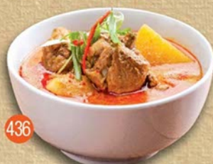
436 Chicken Curry 咖喱鸡 RM19.50