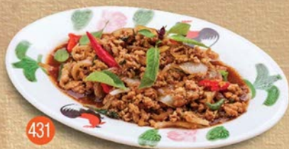
431 Thai Padrik Chicken 泰式香辣鸡肉 RM19.90