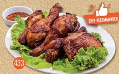
433 Sedap Fried Chicken 食得口乐炸鸡 RM6.90(per pc)