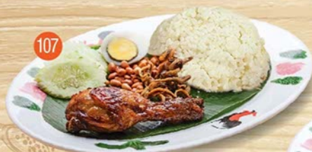
Nasi Lemak with Sedap Chicken 食得口乐炸鸡椰浆饭 RM14.90