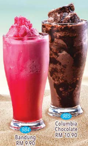
984 Bandung RM 9.90