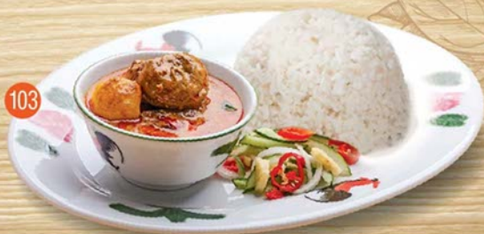
Chicken Curry Platter 103 香辣红番茄鸡