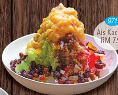
971 Ais Kacang RM 7.90