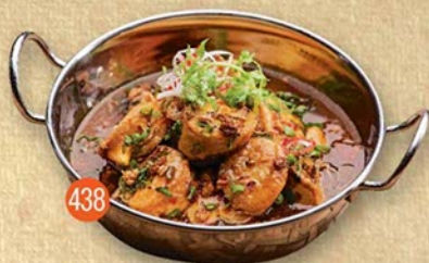
438 Egg Tofu with Beanpaste Sauce 肉碎豆腐 RM14.50

*Prices are subject to 6% Service Charge & 6% Service Tax. *Pictures shown are for illustration purpose only. Actual presentation may vary.