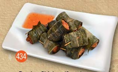
434 Pandan Chicken (8 pcs) 班兰鸡 RM13.50